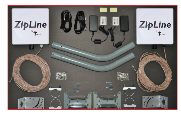
Zipline is Fast and Easy to Install - Just Plug and Go! Everything you need is shipped when you order Zipline.